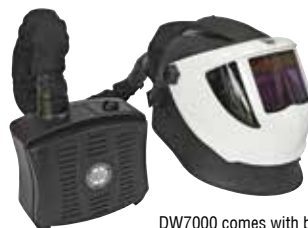
DW7000 comes with battery powered air respirator.